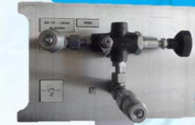
Pressure limiter UAH 410