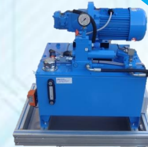
Hydraulic unit fixed or variable flow rate UAH 110 - UAH 130