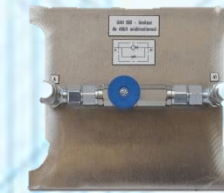
Unidirectional flow rate limiter UAH 560