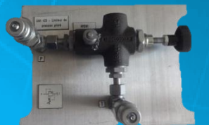
Pressure pilot limiter externally piloted UAH 420