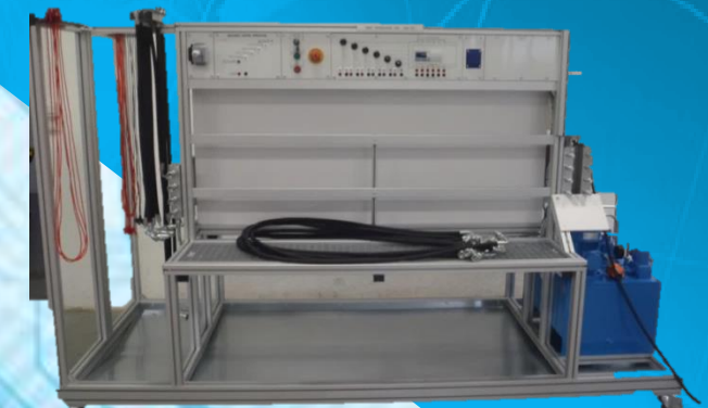
Workstation UAH 012

Reproduction prohibited Copyright 2014 DIDATEC Non contractual photos