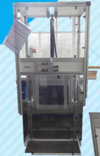
Cylinder raises load with position UAH 921