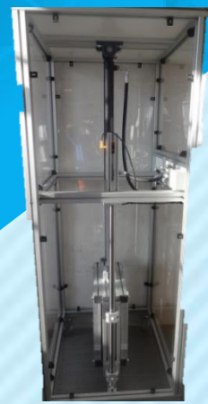
Cylinder raises load UAH 920