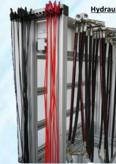
Cords batches UAH 210