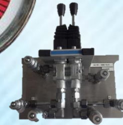
Pilot valve UAH 087 D