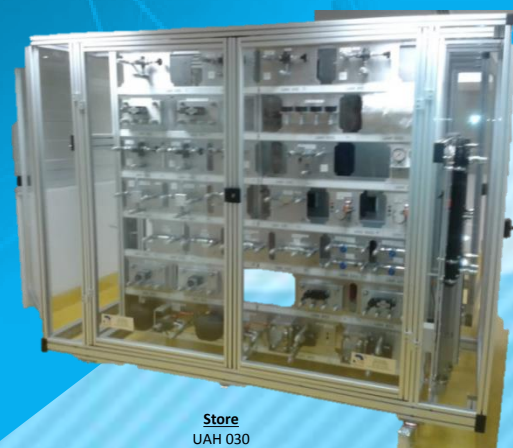
Store UAH 030