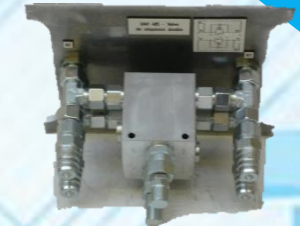
Dual sequence valve UAH 485